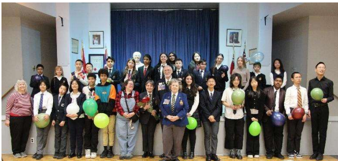
Feb 18 Group Picture with the students at the end of the contest.