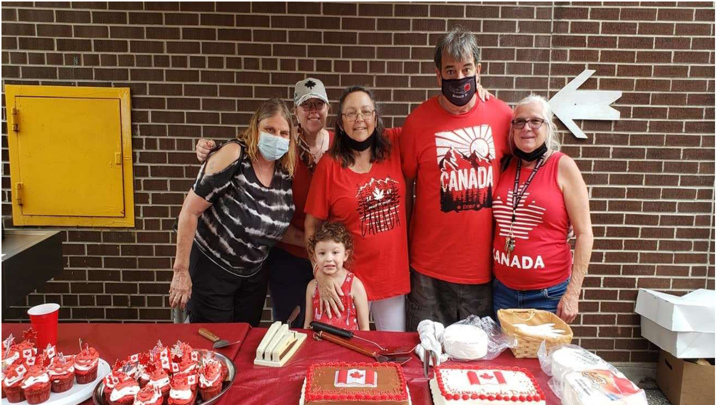
The servers and cooks for Canada Day, mmmm good!