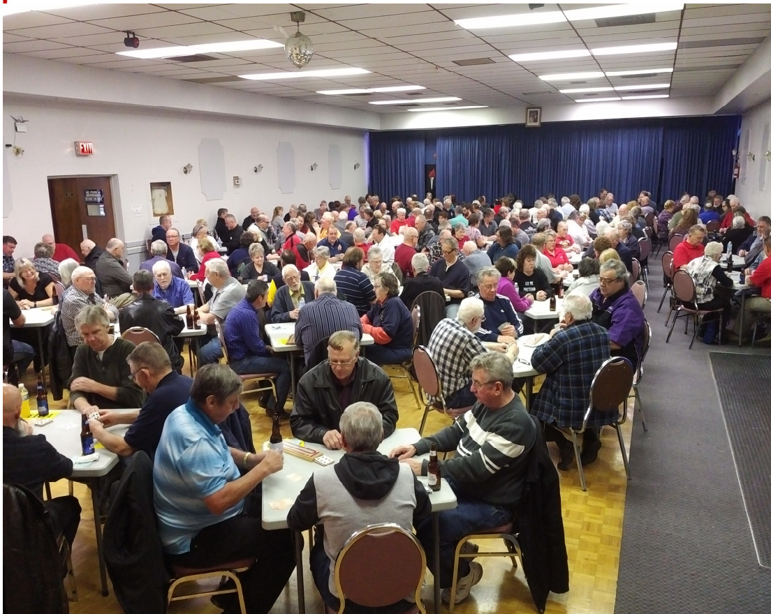
The players at the Provincial cribbage tournament at our Branch 11 on March 10th.