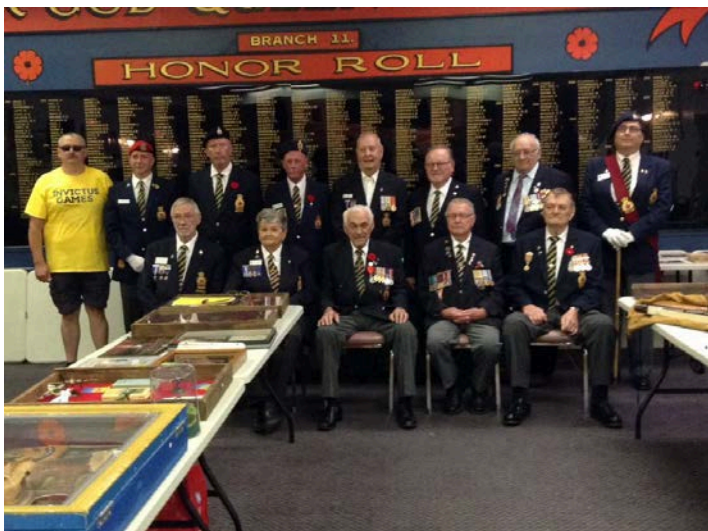
Veterans who came out for the opening ceremony of Legion Week.

Below the Ulster Accordion Band played at the opening of Legion Week