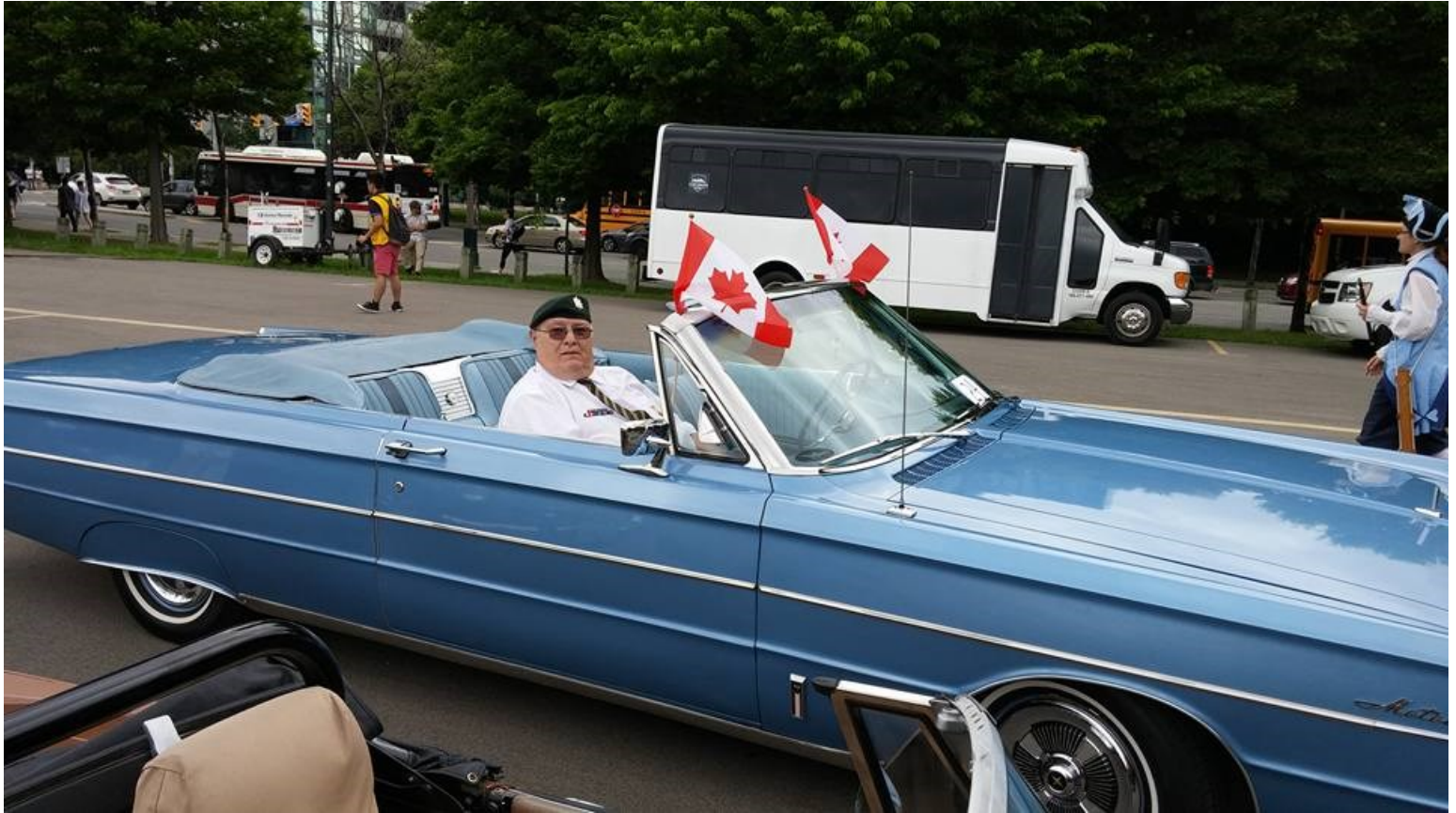
Our President knows how to parade in style on Warriors Day at the CNE.