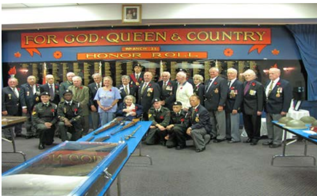
The veterans having their picture snapped--- maybe in Legion magazine?