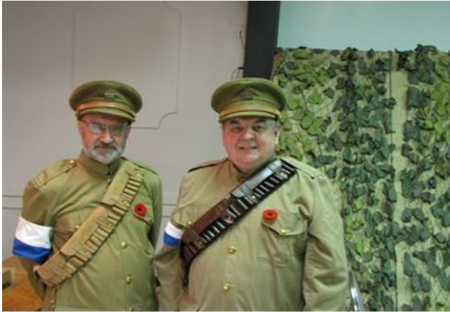
Two Signal Corp soldiers from WWI who were at Legion Week with demonstrations of the primitive communication devices used at the time of the First War