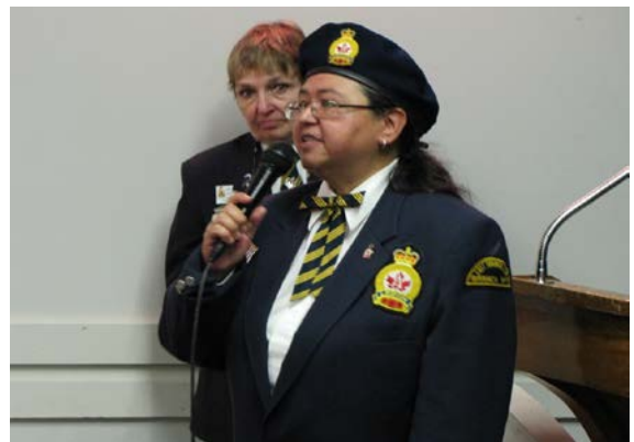
LA First Vice welcome speech