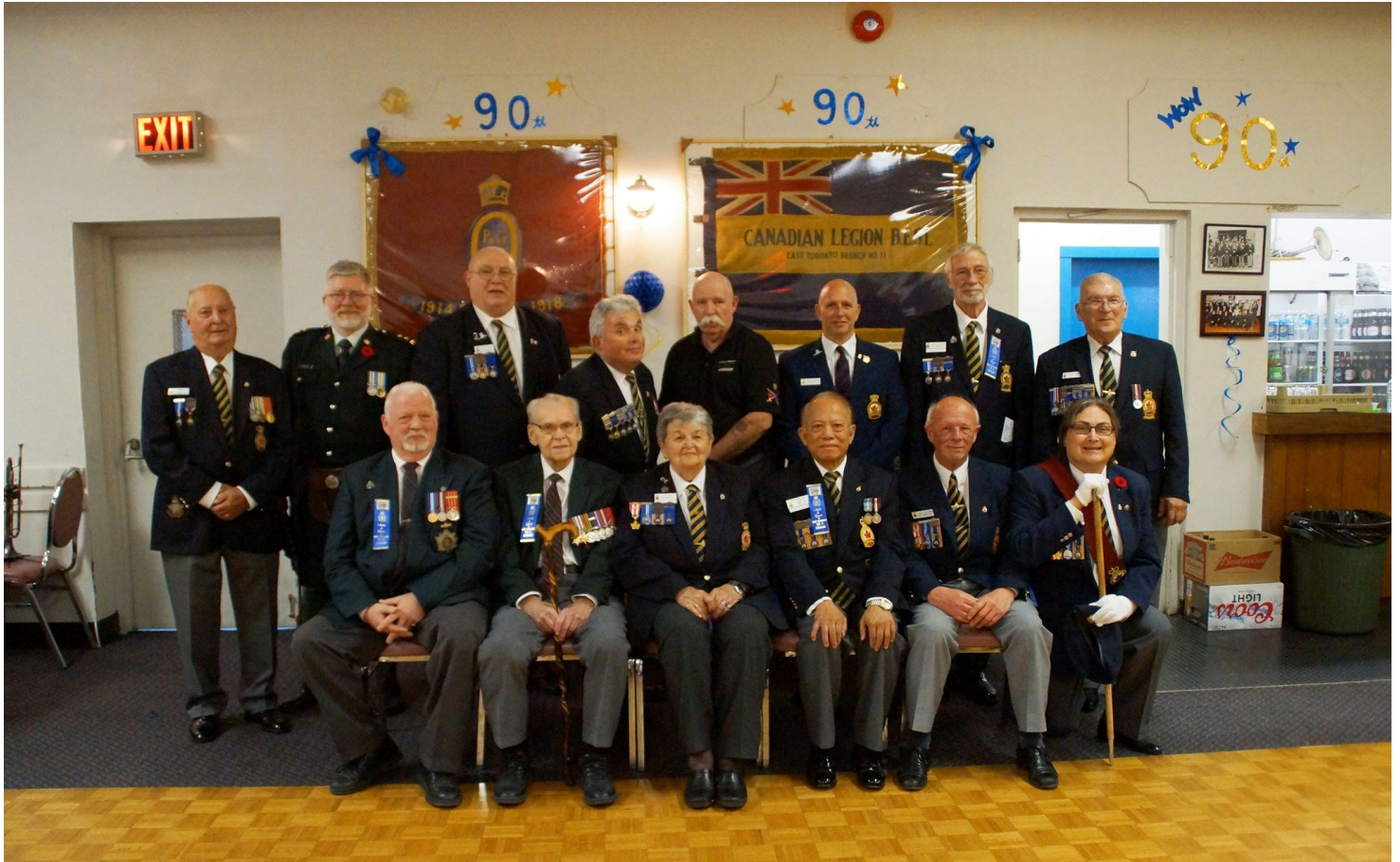
The Veterans who were at Branch 11's 90th Anniversary. Sunday May 28, 2017